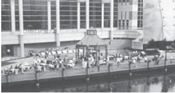
(Above) The weather was perfect and the location ideal as Kiwanians gather around the Gazebo from all over the District to enjoy an outdoor Pig Roast with a College Theme-Show Your Colors.