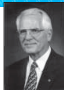
Governor-Elect Charles B. Kincaid

We are proud of all the Kiwanis young people who give so much of their time and talents to make their communities better places in which to live.